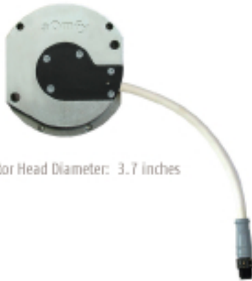
Motor Head Diameter: 3.7 inches

Maintain control of the awning even with the loss of power. This dependable function enables the user to have peace of mind and operate the awning with a crank handle should power be lost. Additionally, Somfy's advanced technology ensures that all settings and programmed controls remain in the motor's memory.