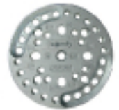
Sunea™ RTS CMO Universal Bracket